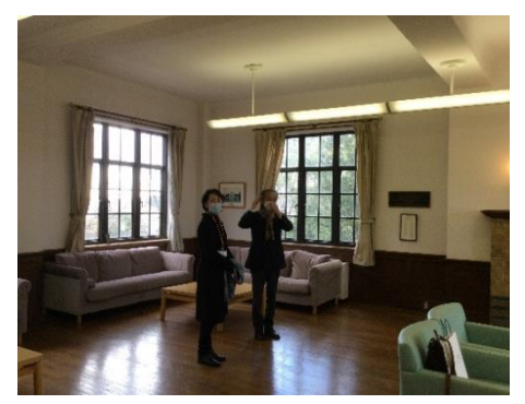
The KCC Room This tablet commemorates the gift of Kobe College Corporation to celebrate the 125th anniversary of Kobe College October 2000 "Women leaders for the new millennium"

Under the plaque is a list of KCC supporters from 1875 to 2000. (Written by Yuki Ohigashi)